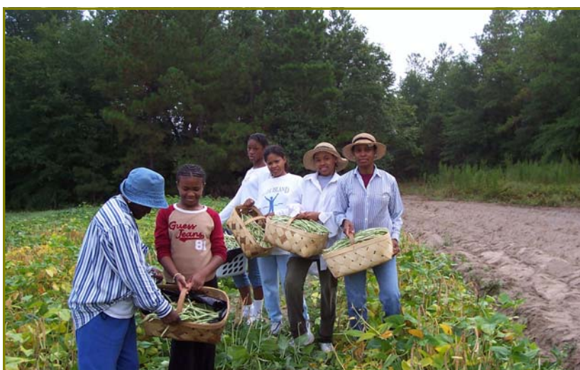
Participants in the Gardening and Gleaning Project

Preserving culture preserves land. As the availability of large land tracts diminish, land trusts are in a pivotal position to affect conservation and land use strategies. Willingness to explore new approaches like working with small tract minority landowners, public and private partnerships and cross-sector collaborations will be important to conserving open space. Land trusts provide guidance on land conservation strategies, connect communities with conservation professionals and provide important mapping and land use trend tools — information that many communities would not otherwise have.