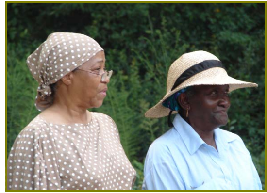
SFHA members perform for International Travel Writers Association

Facilitators or pre-identified leaders help participants pinpoint resources in each segment of the map. A variety of community resources are mapped: a historic school, the local swimming hole, a hunt club, sites where community events take place, etc. Participants identify community resources; these are recorded on the map with a numbered dot; and a corresponding number is recorded on a flip chart with a description of the place, person, or event. Entering this information into a Geographic Information System (GIS) allows for