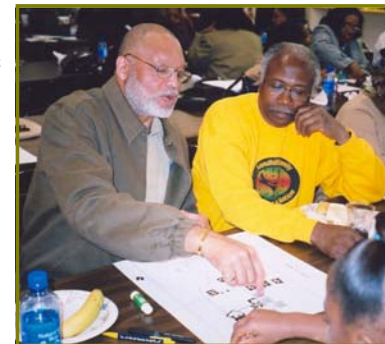
Community members at SFHA workshop

Location: The Sandhills region, with its longleaf pine/ wiregrass ecosystem has long been recognized by environmental conservationists as one of the most distinctive and endangered ecosystems in the country. The Sandhills comprises seven counties in south central North Carolina, including Fort Bragg military reservation. On the human side of the system, the region is home to a nationally significant aspect of African American culture that has flourished in this landscape.