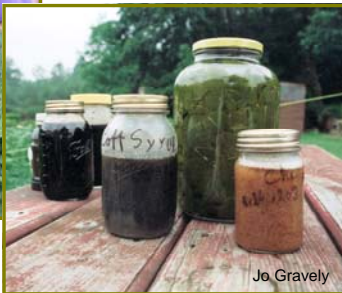
Local growers and Home Remedies

The process is inclusive, interactive and involves a wide range of community members with varying connections to the land and resources.